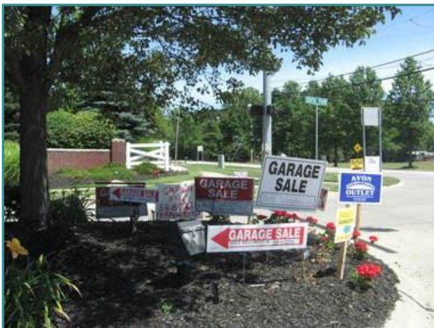
Sign clutter is unsightly